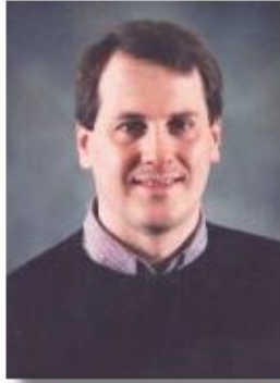
Figure 1: A photograph of the author.